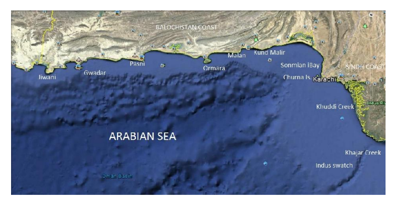
Fig. 1- Pakistan's coast showing some of the areas where WWF crew-based observers are working on fishing vessels and where baleen whales are sighted

Initally, efforts were made to train and place 'external' observers with bachelor degrees in science. However, due to the length of fishing trips (about 35 days on average) and inadequate facilities on board, this approach was abandoned. Instead, one of the crew members (usually the skipper) would be trained and given a monetary incentive to collect data on tuna catches, as well as entanglement of cetaceans and other megafauna (turtles, sunfish, mobulids etc.). Within a short time, these crew-based observers were generating an unexpected volume of useful data about various aspects of tuna gillnet operation and catches of target and non-target species. Following the initial success of the first two crew-based observers in 2012, the number of observers was increased to four. Funds for the first two observers were provided by the Indo-Pacific Cetacean Research and Conservation Foundation (IPCRCF) from the Australian Marine Mammal Centre (AMMC). Additional observers were funded by WWF-Pakistan.