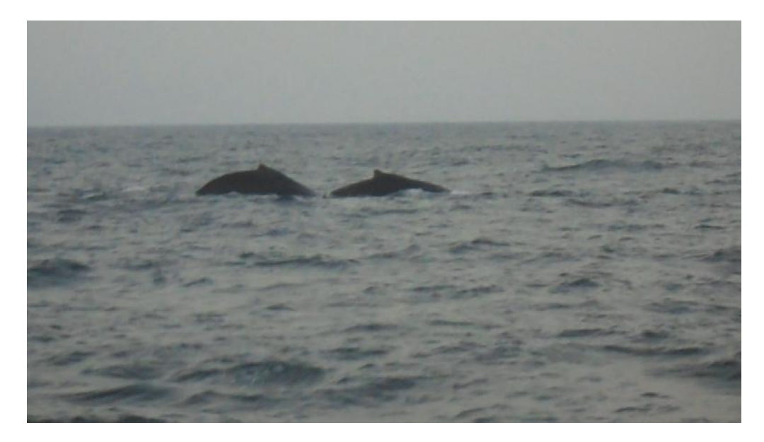
Fig. 7 Two Arabian Sea humpback whales sighted near Malan

The sightings data from this project do not clearly indicate any pattern to the depths in which baleen whales are observed, with sighting depths ranging from 10 m to more than 3,000 m. However, in summer whales appear to be concentrated in waters of between 30 to 80 m depth. Whales occurring along the Balochistan coast venture into deeper oceanic waters, which may reflect the narrow continental shelf in this region (Fig. 7). It should be noted that because observers are often engaged in setting or retrieving fishing gear when sightings are made, opportunities for photographic/video confirmation of species and behavior are sometimes missed. The vessels, which are platforms of opportunity, are unable to abandon their fishing operations to follow and/or photograph whales.