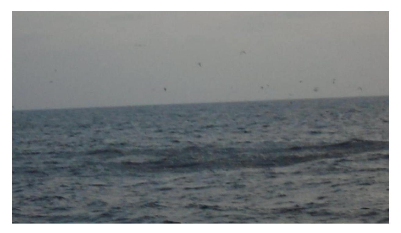
Fig. 4. Dense school of pelagic shrimps that attracts baleen whales-off Khuddi Creek- October, 2016.