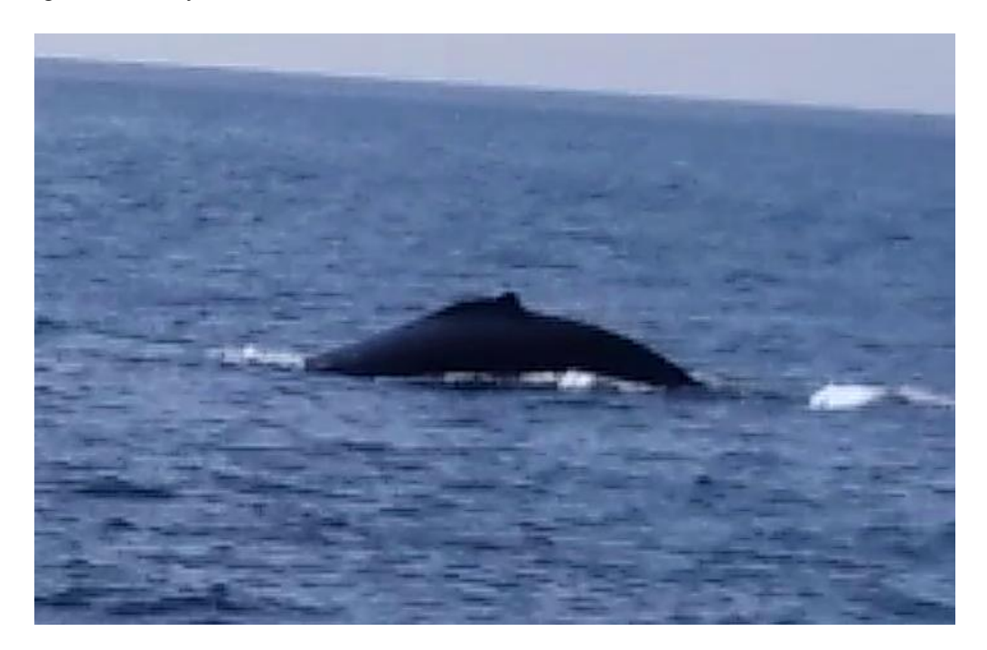
Fig. 6 Arabian humpback whale sighted near Indus Swatch

The collected data indicates that although baleen whales are found almost throughout the year in Pakistan, their occurrence appears to increase in spring (April and May) along the Balochistan coast (between Kund Malir and Ormara). Fishermen report the presence of large schools of pelagic shrimps in that area. In addition schools of Sardinellas are also mainly observed in the Ormara area. Baleen whales, especially Arabian Sea humpback whales, are reported to feed on these schools of pelagic shrimps and Sardinellas , which is consistent with the stomach contents reported by Mikhalev (1997, 2000). Pelagic shrimps belonging to Euphausia, Segestes and Acetes are known from the Arabian Sea coast bordering Pakistan. In winter (September to December) a large number of whale sightings are reported from the Sindh coast mainly from the Swatch area (mouth of the Indus River) and in the offshore waters of Karachi. However, very few sightings were recorded from Balochistan coast during summer, mainly due to the seasonal (monsoon) closure of the tuna gillnet fishery.