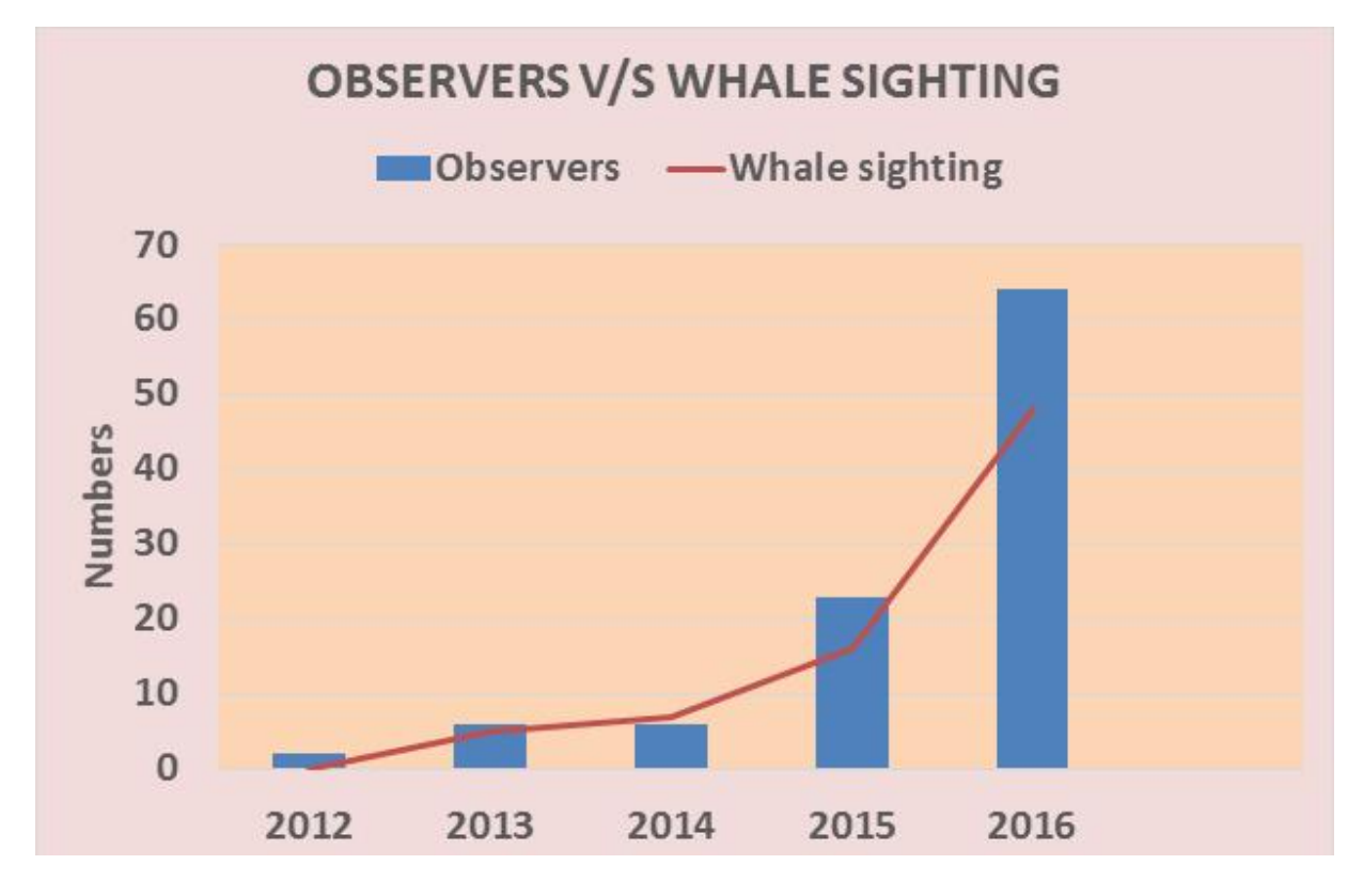
Fig. 5. Relationship between number of observers and baleen whale sightings

The fishing crew observer programme initiated by WWF-Pakistan has provided an opportunity to record sightings of Arabian humpback whales and other baleen whales from coastal and offshore waters of Pakistan. Figure 4 indicates that (as might be expected) with the increase in the number of observers the frequency of sighting of whales has also increased. The results also indicate that most of the tuna gillnet vessels which are mainly based in the Karachi Fisheries Harbour operate all along the Sindh coast and in the Somniani Bay up to Ormara.