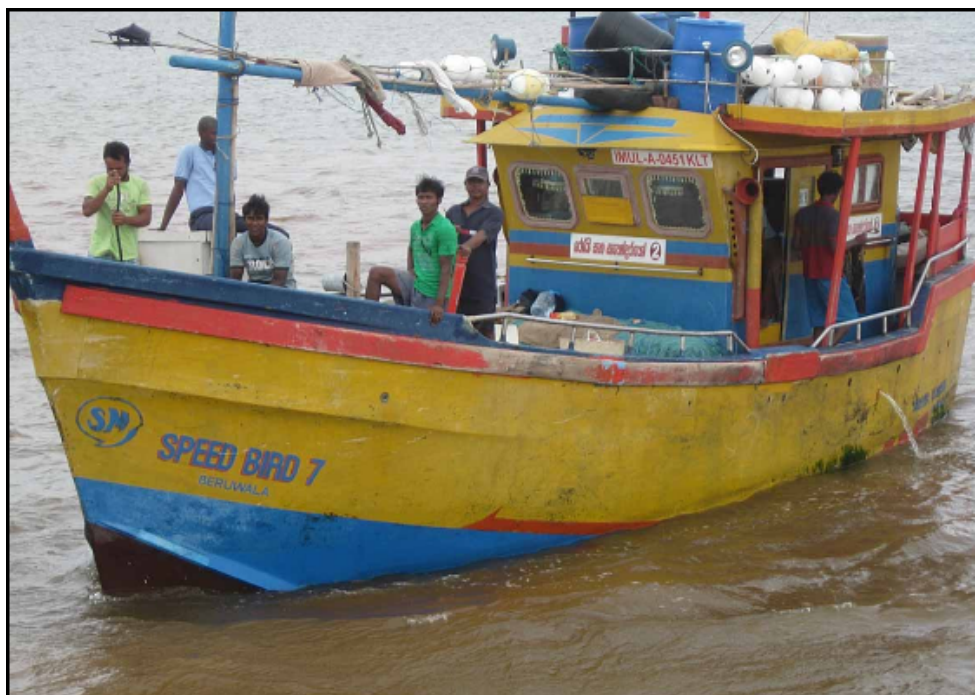
FV SPEED BIRD 7