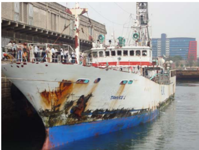
The TAWARIQ 1 following her escort into the port of Dar Es Salaam, Tanzania