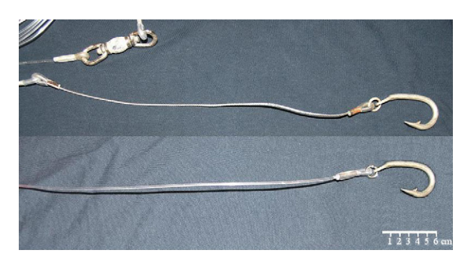
Fig. 2. The wire (above) and nylon (below) leaders used in the study. Also shown is a weighted swivel.

The wire leaders used in the study were 30 cm, stainless steel, six-strand wire cable (Fig. 2). A 38 g swivel was attached to the branchline 5 m above the hook. The nylon leaders did not have a weighted swivel. They were 2 mm diameter (250–300 kg breaking strain) nylon. One longline vessel used 30 cm double nylon leaders. The nylon monofilament is a copolymer, with