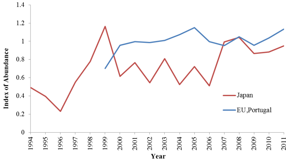
Fig. 2. Blue shark: Comparison of the blue shark standardised CPUE series for the longline fleets of Japan and EU, Portugal.

The standardised CPUE of blue shark catches by the Portuguese longline fleet in the Indian Ocean show little variability between 1999–2011 (Fig. 2; Coelho et al. 2012).