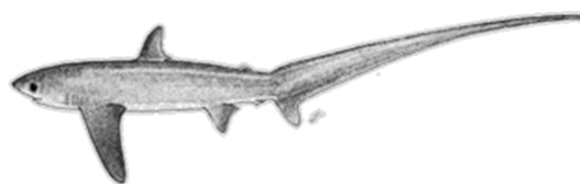
TABLE 1. Pelagic thresher shark: Status pelagic thresher shark ( Alopias pelagicus ) in the Indian Ocean

Indian Ocean Tuna Commission Commission des Thons de l'Océan Indien