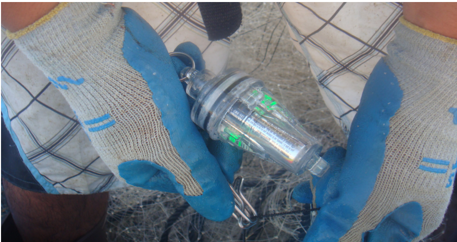
Lights attached to the nets create enough of a warning to alert sea turtles to a barrier

Using widely available fishing lights (LED or chemical lightsticks) to illuminate gillnets, the design creates enough of a warning signal to alert sea turtles to the presence of a barrier, allowing them to avoid it. Experiments with illuminated nets were conducted in Baja California, and the trials reduced green turtle bycatch by 60% without affecting the fishery target catch rates or catch value.