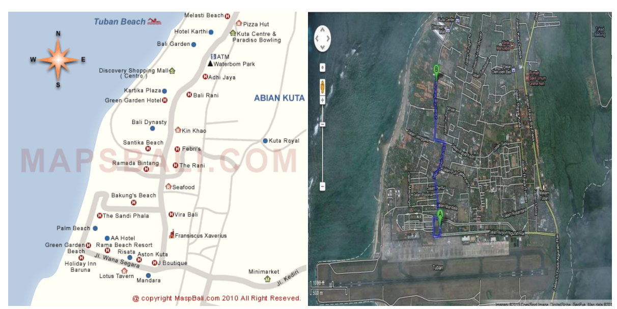
Location of the Working Party in Bali, Indonesia