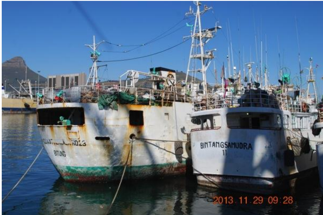
Berkat Menjala No. 23 (to the left), Port of Cape Town, South Africa, November 2013.

Confidential police information has been removed