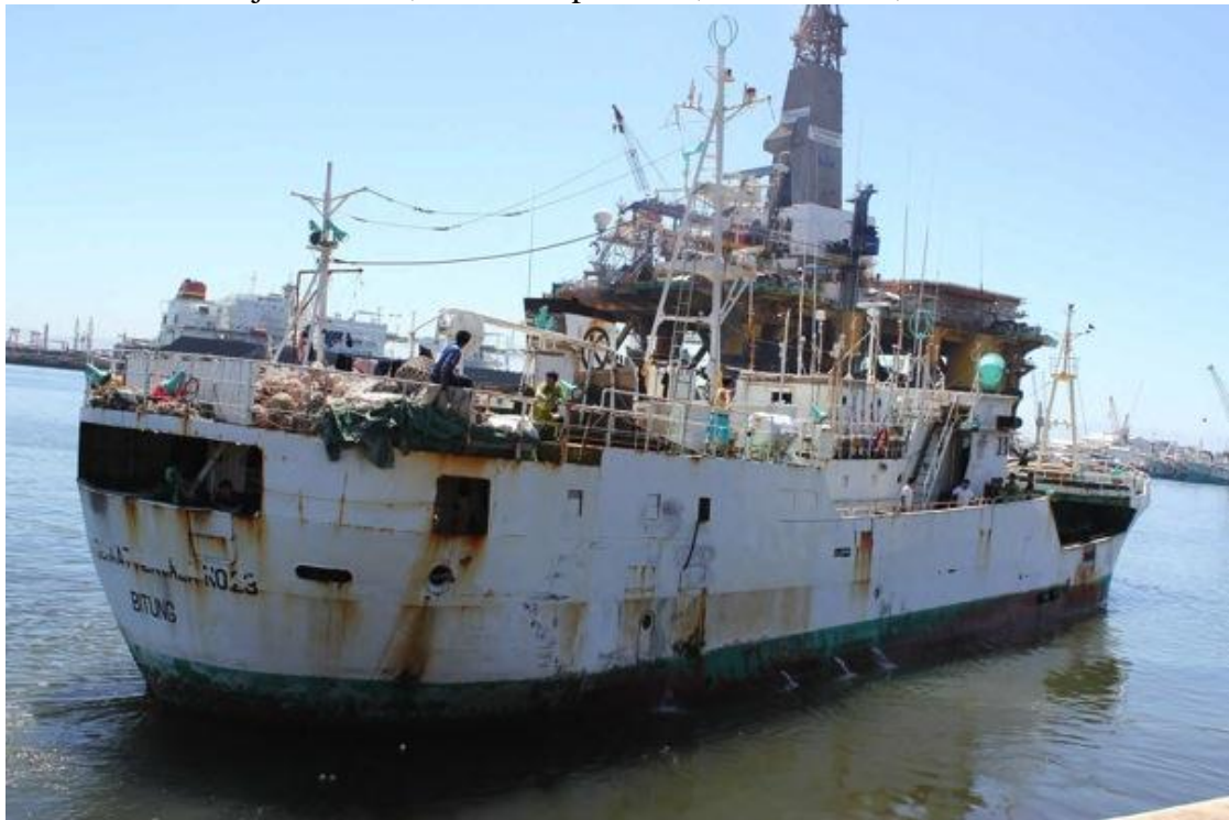
Berkat Menjala No. 23, Port of Cape Town, South Africa, November 2013 (with a floating platform in the background).