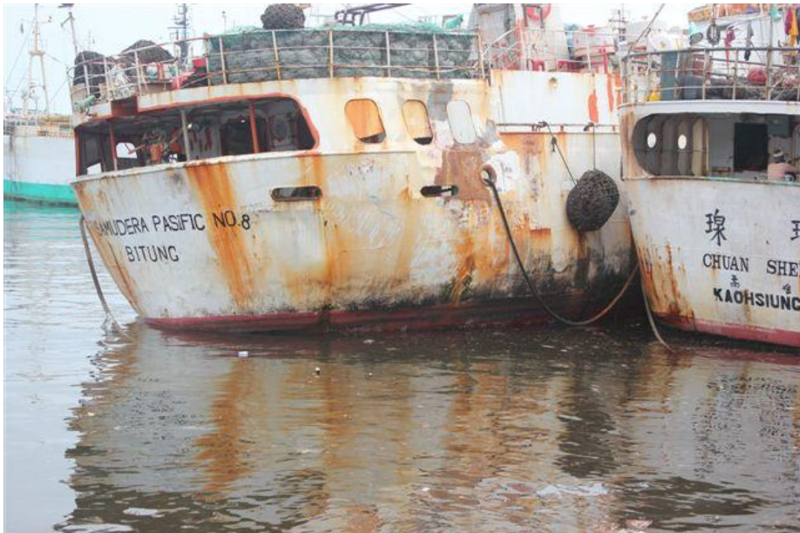
Samudera Pasific No. 8 (to the left), Port of Cape Town, South Africa, November 2013.