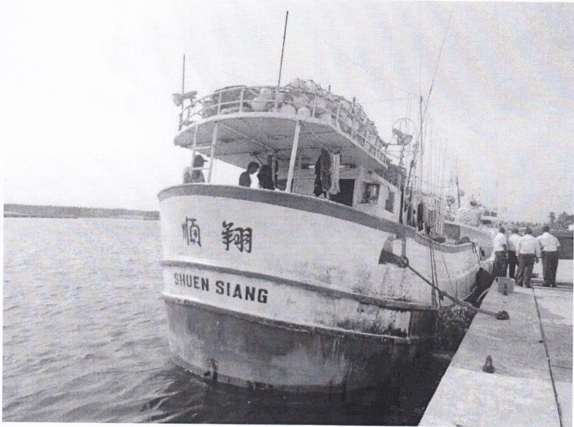
Annex 2 –Photograph of the vessel Shuen Siang