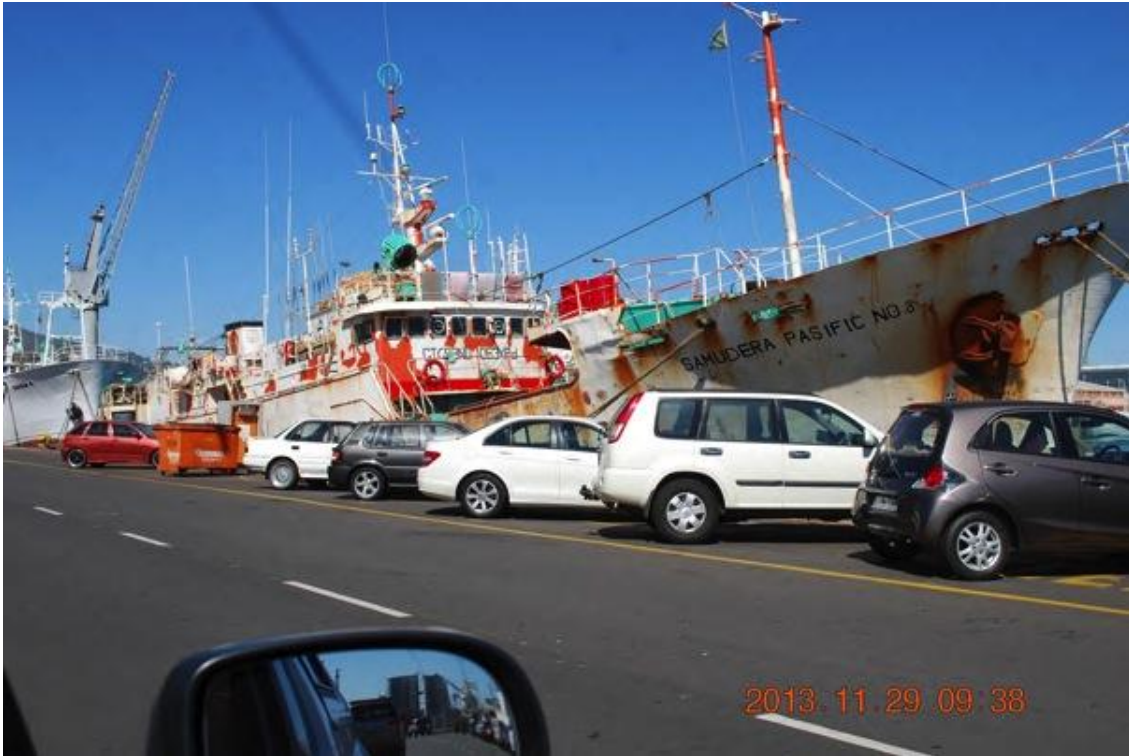
Samudera Pasific No. 8, Port of Cape Town, South Africa, November 2013.