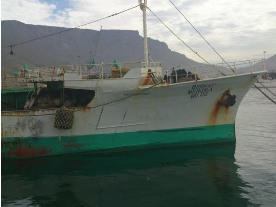
Berkat Menjala No. 23, Port of Cape Town, South Africa, November 2013.