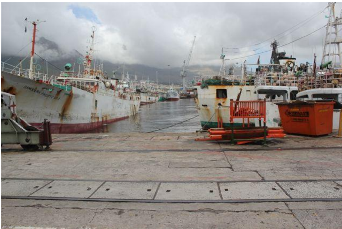
Samudera Pasific No. 8 (to the left), Port of Cape Town, South Africa, November 2013.

Confidential police information has been removed