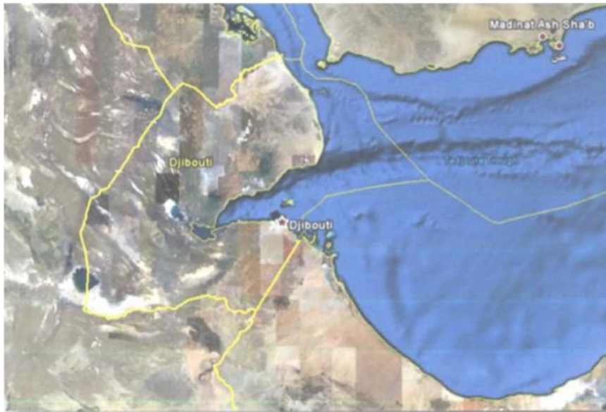
Map of Djibouti showing its EEZ