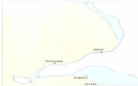
The continental plateau (turquoise) of the Djibouti Coast.