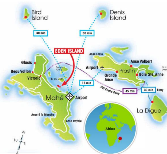
Location of Eden Bleu Hotel (Eden Island)

Eden Bleu Hotel Conference Room Eden Island