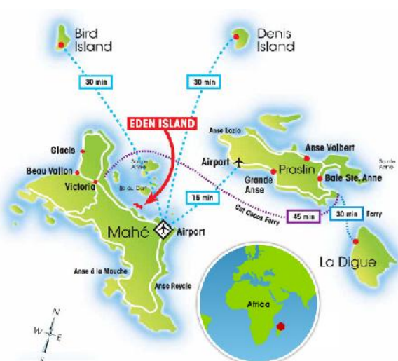
Location of Indian Ocean Tuna Commission