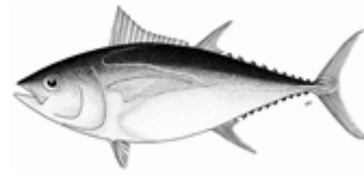
TABLE 1. Bigeye tuna: Status of bigeye tuna ( Thunnus obesus ) in the Indian Ocean.