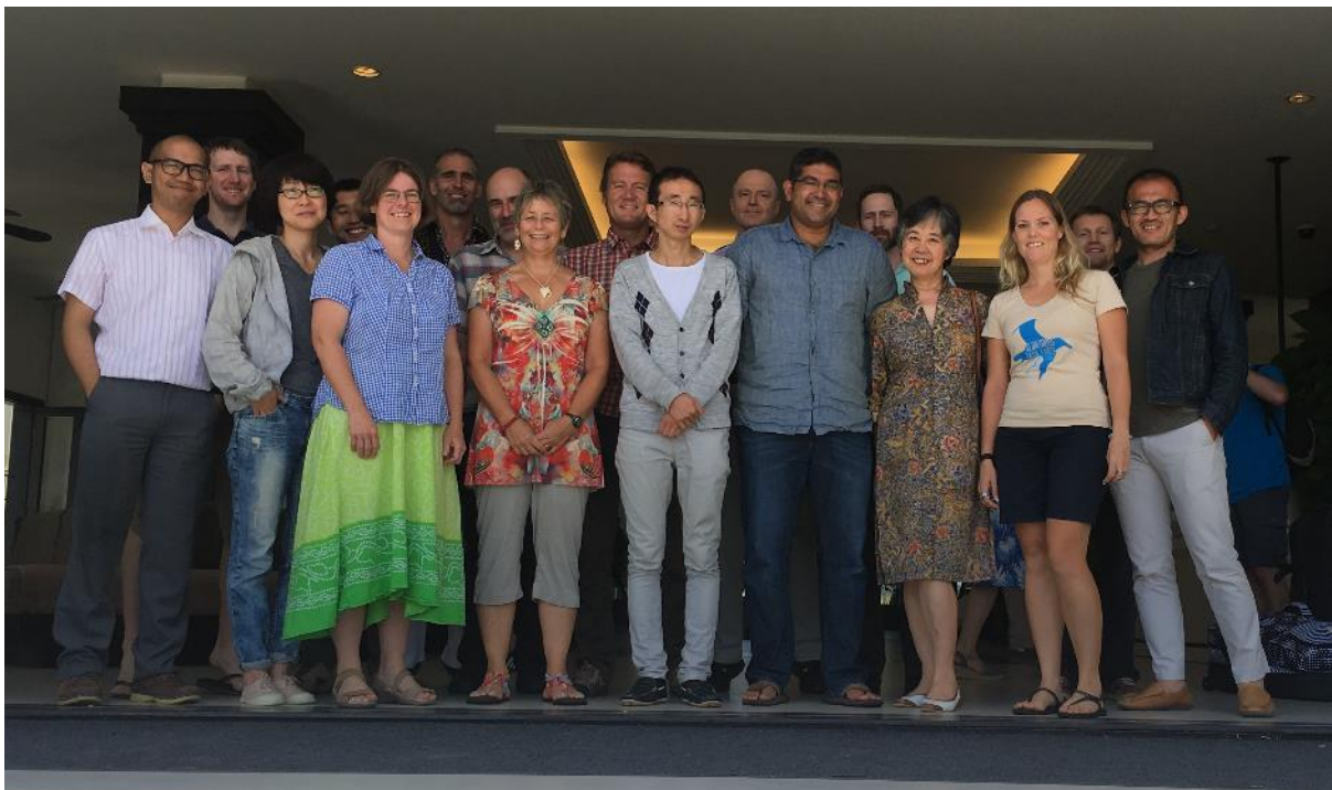
Figures 2a and b: Team photograph including all the participants from each workshop (a – Kruger National Park; b – Hoi An). Additional images are available on request.