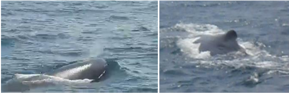
Fig. 3. Sperm whales sighted from (a) off Ormara on March 17, 2019 and (b) off Gunz on February 4, 2019