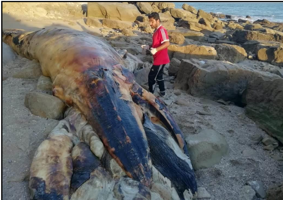
Fig. 8. Bryde's whale ( Balaenoptera brydei ) stranded at Chill, near Jiwani, Balochistan coast on November 29, 2019.