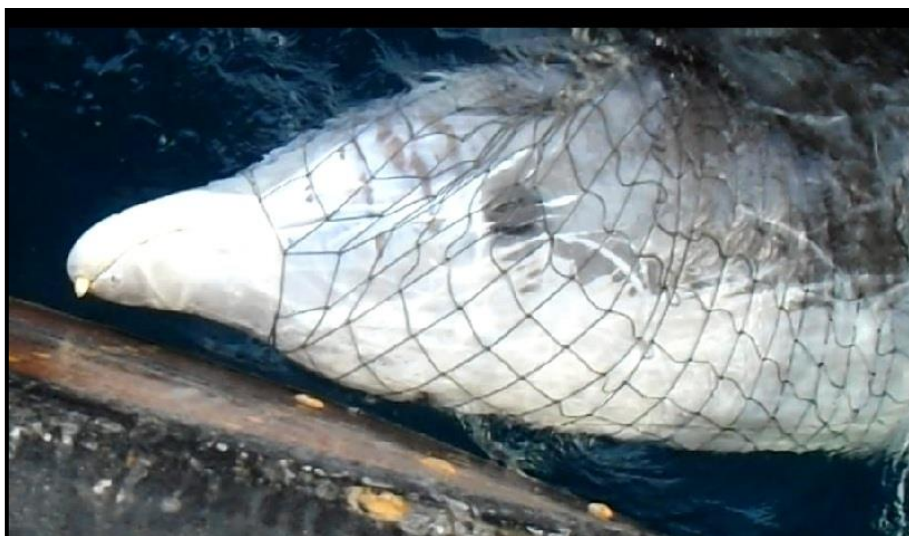
Fig. 4. Cuvier's beaked whale entangled in gillnet in off Ormara waters in January, 2019

A stranding of a juvenile blue whale was documented in Pushukan, Gwadar (West Bay) on 2 nd April, 2019 (Fig. 7). It was 10.36 m long. The cause of death of the juvenile blue whale could not be ascertained. The whale is buried at Pushukan with the intention of later recovering its skeleton. Tissue samples from the specimen were obtained for later genetic analysis.