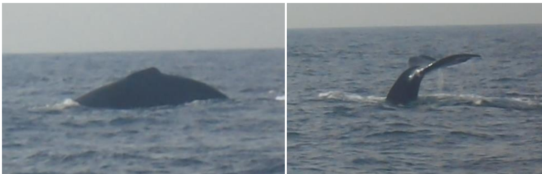
Fig.1. Arabian Sea humpback whale sighted along Ghorabari, Sindh on April 26, 2019

During 2019, only 3 sightings of Arabian Sea humpback whales (Fig. 1) were recorded from the continental shelf and slope area mainly along Sindh coast (eastern coast of Pakistan) whereas there were four sightings from Malan and Sapat along Balochistan coast (Fig. 2). Moazzam and Nawaz (2017) reported feeding on planktonic shrimp and sardinellas in waters along the coastline. It may be added that some of the unidentified baleen whales reported here may also include Arabian humpback whales. There were no sightings of Arabian Sea humpback whales from the central part of the Arabian Sea in 2019 whereas, 4 ASHW were reported that area during 2018 season.