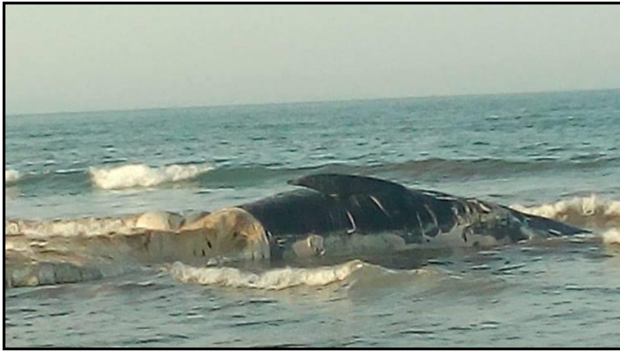
Fig. 7. Blue whale ( Balaenoptera musculus ) juvenile stranded at Pushukan, Gwadar (West Bay), Balochistan coast on April 2, 2019.