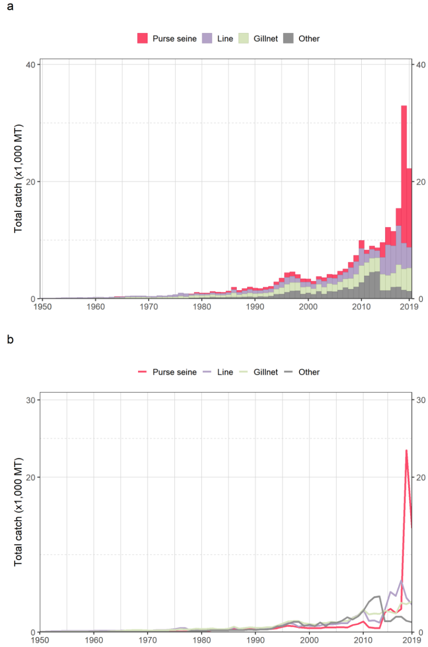
Fig. 1. Annual time series of (a) cumulative and (b) individual nominal catches (MT) by gear group for bullet tuna during 1950–2019. Purse seine : coastal purse seine, purse seine, ring net; Line : coastal longline, hand line, troll line; Gillnet : coastal and offshore gillnets, driftnet; Other : all remaining fishing gears