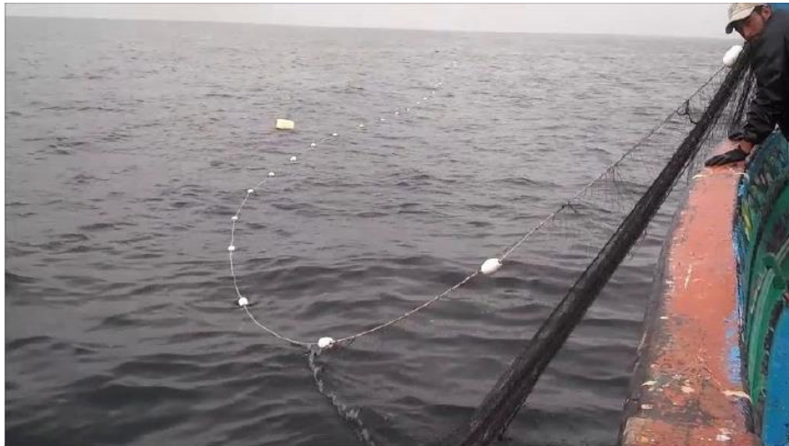
Fig. 1. Surface gillnet showing arrangements of floats on the headrope.

Gillnets which were traditionally used by fishermen are placed on the surface of the sea with the help of floats (Styrofoam). The floats used to be placed after every 4.5 meters (50 eyes of nets). A weight of 2 kg (stone) was used to be tied to the footrope after every 60 m. After every 160 meters (length of 2 net panels) a large float (usually a plastic canister of 20 to 30 liter) is attached. This arrangement which is locally known as “Bither” enables the net to remain at surface (Fig. 1).