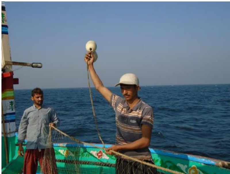
Fig. 2. Floats attached to head-rope of subsurface gillnet

Length of subsurface gillnet is not changed and ranged between to 7 to 12 km. The net consists of headline and footrope. After every 8 meters (2 fathoms), two floats are attached through a rope which is about 1.5 to 2 meters long to the headline (Fig. 2). After every 35 to 50 meters one stone of about 2 kg is attached to foot rope. After every 160 meters (length of 2 net panels) a large float (usually a plastic canister of 20 to 30 litre) is attached, as also done in case of surface gillnets. Using this arrangements, the gillnet remains 2 meters below the surface during fishing operation (Fig.2).