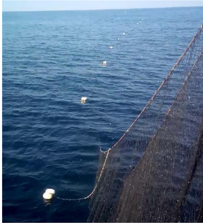
Fig. 3. Subsurface operation keep the gillnet 2 m below the sea surface.