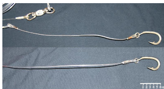
Fig. 2. The wire (above) and nylon (below) leaders used in the study. Also shown is a weighted swivel.

The wire leaders used in the study were 30 cm, stainless steel, six-strand wire cable (Fig. 2). A 38 g swivel was attached to the branchline 5 m above the hook. The nylon leaders did not have a weighted swivel. They were 2 mm diameter (250–300 kg breaking strain) nylon. One longline vessel used 30 cm double nylon leaders. The nylon monofilament is a copolymer, with