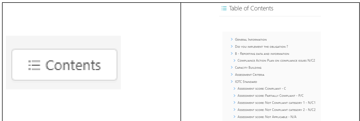
Figure 1: Table of contents available in individual requirement.

These three new reporting requirements are highlighted in yellow for ease of reference in the meeting document IOTC-2026-WPICMM09-13 Add1 and that all assessment categories and all IOTC standards are accessible from the table of contents of the requirements in the e-MARIS application: