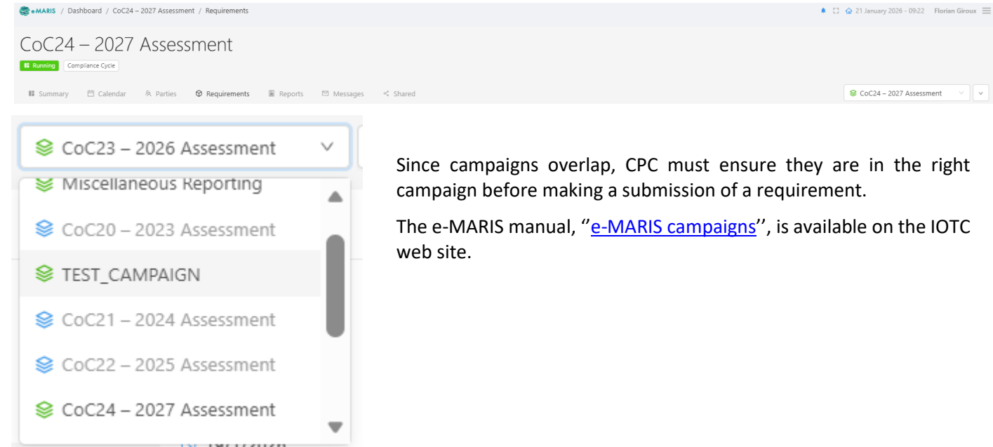
Figure 1: The e-MARIS campaign menu.

In the e-MARIS application, the campaign “CoC24 - 2027 assessment”, is available from the compliance dashboard under the campaign menu, as presented below: