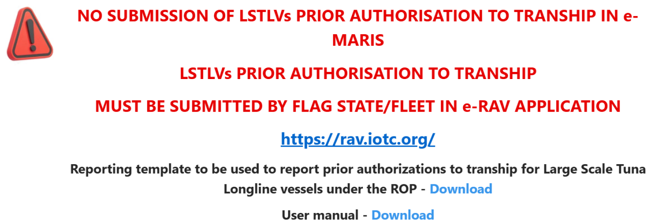
Figure 14: Requirement 8.7 – Integration e-MARIS/e-RAV. Requirement 8.7 is provided in PDF format in the meeting document IOTC-2026-WPICMM09-12_Add4 and is available for consultation in the e-MARIS application - CoC24 – 2027 assessment campaign .