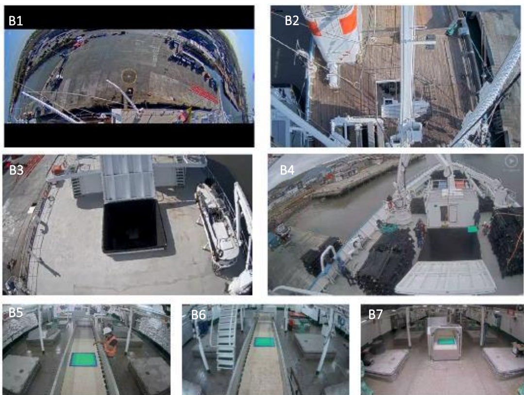
Figure 1. (A) An example of a 6-cameras EM system installed in a purse seine covering main areas of fishing and fish handling operations (from Murua et al., 2020b) and (B) 7-cameras EM system (4 in the upper deck and 3 in the well deck) installed in a purse seine covering main areas of fishing and fishing handling operations including 1 more camera in the conveyor belt: (B1) 360° Panoramic view camera (e.g port side view), (B2) Crows nest stern view camera, (B3) Working deck crane camera view , (B4) Foredeck view camera, (B5) Conveyor belt stern camera view, (B6) Conveyor belt middle camera, and (B7) Conveyor belt bow camera.