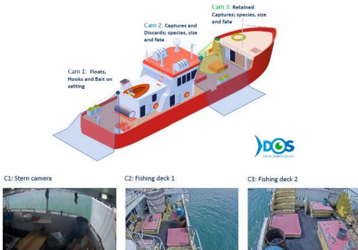
Figure 2. An example of a 3-camera EM equipment installed on a longline covering main areas of fishing and fish handling operations. View of the 3 cameras: (left panel) Stern camera - setting longline providing information on hooks, floats, mitigation techniques and bait; (middle panel) Fishing deck 1 - hauling information, captures and discards, species ID, size and fate; and (right panel) Fishing deck 2 - fate of the species, size, species ID.