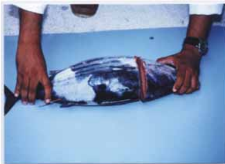
a. Saw off the head of the frozen skipjack