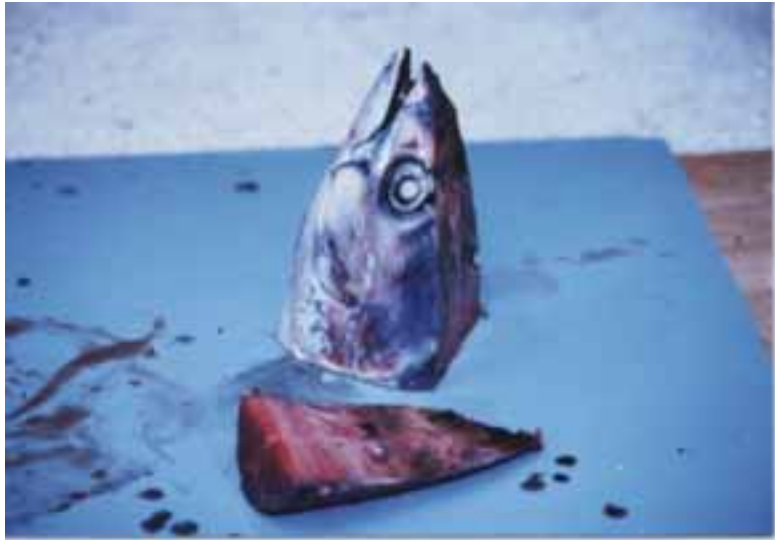
c. Skipjack head with top removed – leave to thaw