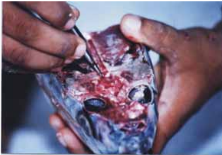
d. Remove hind-brain to locate otoliths