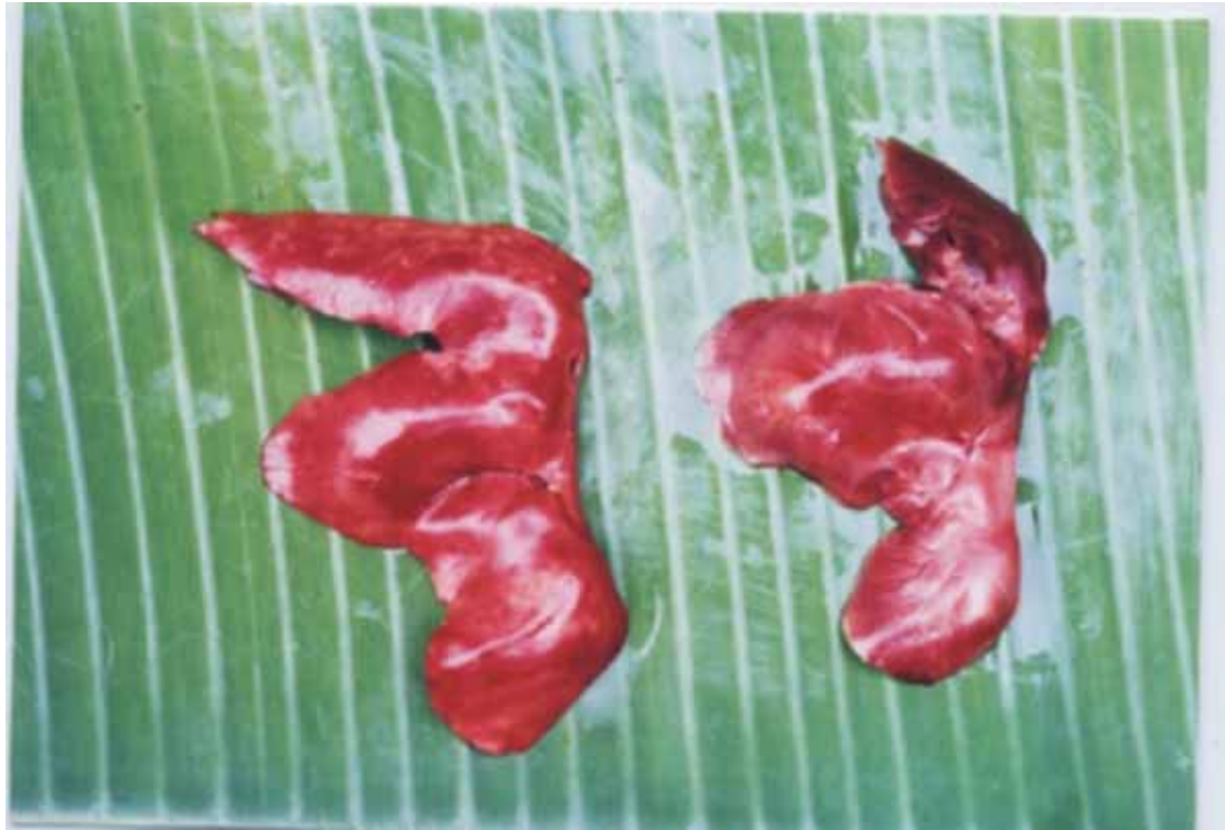
Livers of yellowfin tuna (left) and bigeye tuna (right)