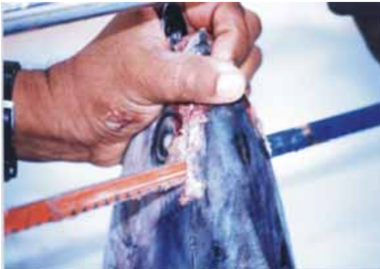
b. Saw off the top of the head