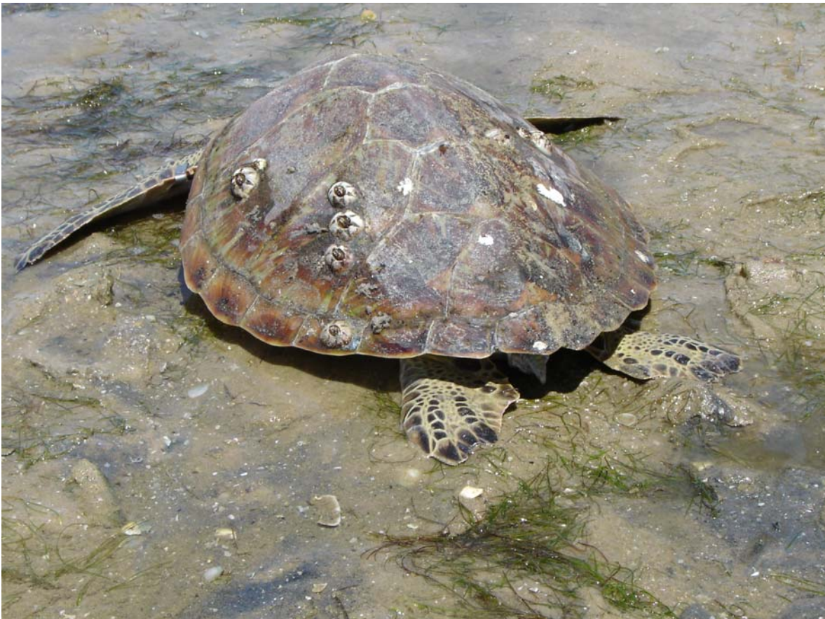
A tagged green turtle is released at BANP

This report presents published information that was available to the authors. Several individuals have been consulted, especially tourism operators from remote locations in the coast that have provided data regarding occurrence and threats to marine turtles. Therefore, this document should be revised and updated periodically.