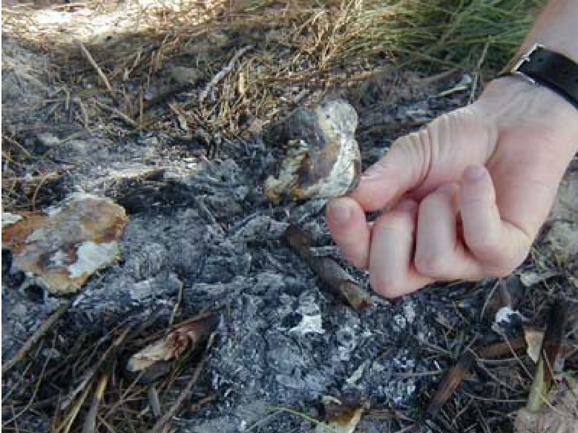
Figure 7. Marine turtle meat is commonly consumed by coastal populations. The photo shows a fire where a turtle was consumed, moments before, by fishermen at Tofo beach, Inhambane.