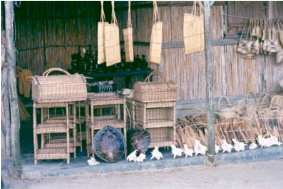
Figure 6. Green turtle carapaces ( Chelonia mydas ) for sale in the local market, Bilene beach.

The growth of coastal tourism in the country (Abrantes & Pereira, 2003), could stimulate the development of this activity, which could be undertaken by both tourism operators as well as by the local communities. However, being a highly seasonal activity it would not support a large industry. It could be an extra service offered by settled tourism operators or an alternative for the local communities. Either way, these operations will require specific regulations to be sustainable.