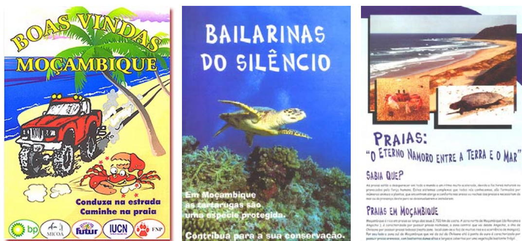
Figure 8. Posters and brochures used during the 2000/2001 Welcome Campaign.

Coordinated by FNP, in collaboration with MICOA, FUTUR, the Navy, Migration Authorities, Police and Local Administrations. This campaign focused on coastal tourism in southern Mozambique (Maputo, Gaza e Inhambane) and involved education and awareness to the conservation of coastal and marine environment, mainly sandy beaches, coral reefs and marine turtles (Figure 8). This carried out by the distribution of brochures, posters and stickers at the borders, hotels, camping sites, restaurants, etc. (Abrantes & Pereira, 2002).