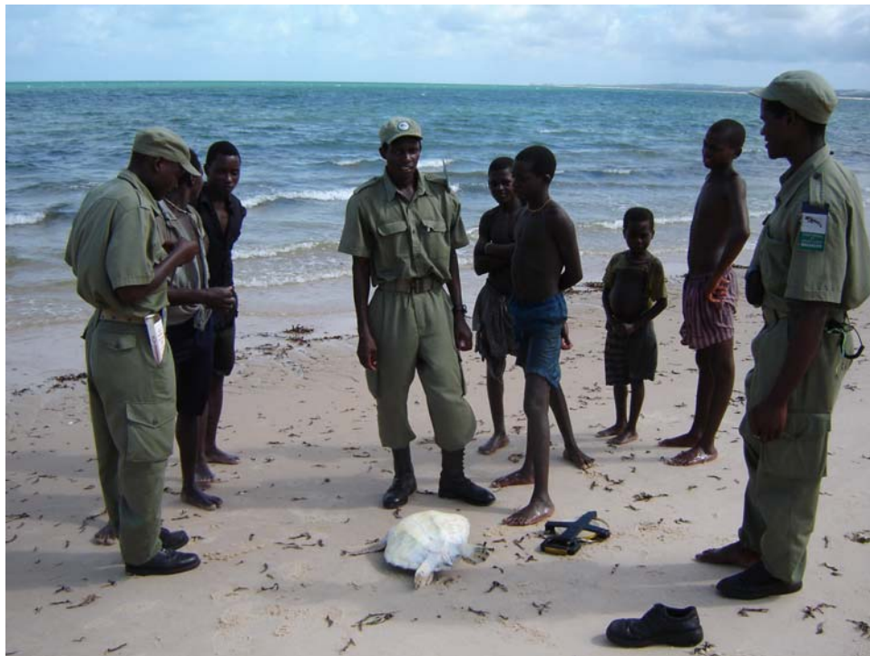
Education and enforcement activity by BANP guards