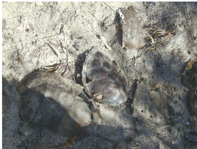
Figure 5. Remainings of the carapace of marine turtles captured, grilled and consumed in the coastal dunes in Praia do Tofo.

Due to the lack of information from remote areas, it is difficult to predict in which areas marine turtle mortality is highest. As mentioned before turtle mortality is widespread throughout almost the entire coastline. Nevertheless, the Sofala Bank (Gove et al. , 2001), Vilankulos - Inhassoro (Gove & Magane, 1996), and Barra-Tofo-Tofino and Bilene (Pereira, M.A.M., pers. obs.; Figure 5) deserve especial attention. Up in the northern part of the country, although there is a great occurrence of marine turtles (Hughes, 1971), information is still scarce. Therefore, one should consider that mortality should also be high in areas with the greatest concentration and nesting of marine turtles, as reported by Hughes (1971).