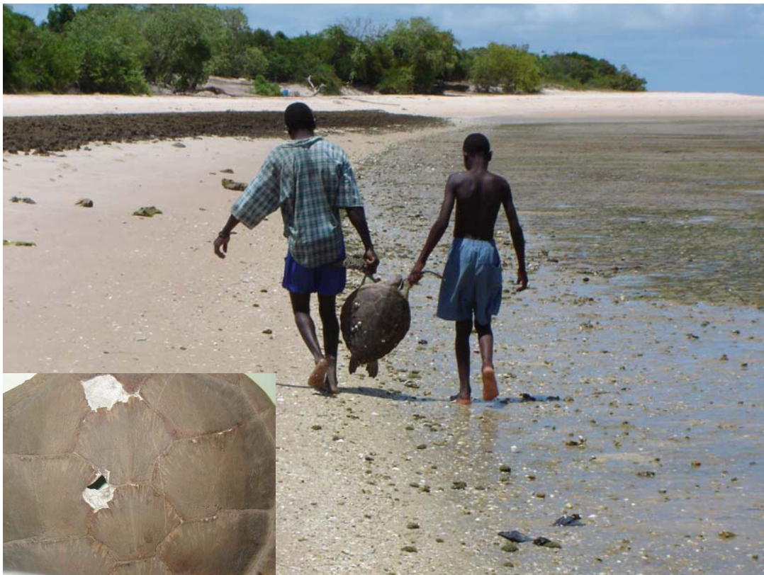
Figure 4. Green turtle captured in BANP. Inset: carapace of a green turtle captured by spear gun at Tofo beach, Inhambane.

Currently, the practice of capturing marine turtles for feeding and posterior sale of its carapace is becoming a common practice in the coastal zone of the country, with turtles being “accidentally” caught in trawling or gill nets, caught on the beach during nesting or using spear guns (Figure 4).